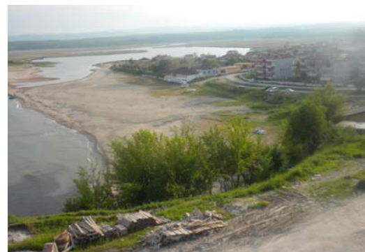
Fig 4. View of Lake Mert lagoon, south of İğneada, and summer homes.