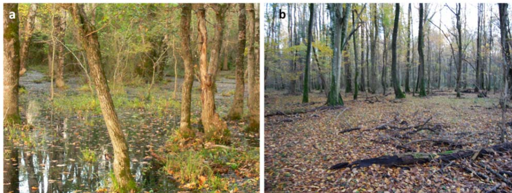
Fig 10. Longose forests around İğneada in (a) spring and (b) autumn