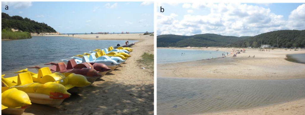
Fig 8. Views of Kastro Bay: (a) Sea biking and (b) coastal spit.