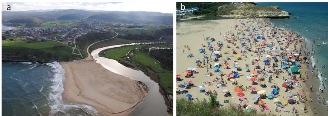
Fig 6. Views of Kıyıköy beach (a) before and (b) during tourism season (Photo courtesy of Kıyıköy Municipality).

In this area, there are some small lakes such as Lake Pedina (15 m asl), Lake Söğütlü (20 m asl), Lake Hamam (5 m asl), Lake Deniz (1 m asl) and Lake Saka (1 m asl) (Fig 5). The largest of these are the Hamam and Pedina lakes, surrounded by forest. Lakes Deniz and Saka, on the other hand, are found behind the shoreline.