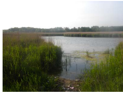
Fig 3. View of Lake Erikli and reed fields.

West of the lagoon there is a reed-swamp with a maximum width of 700 m. This swamp is limited by the alluvial plain covered with longose (water-covered) forest to the west (Fig 3b). 200 meters behind the shoreline, Lake Erikli occupies part of an alluvial plain covered with submerged forests and swamps. The Lake Mert lagoon south of İğneada also occupies the lower part of an alluvial plain, as with Lake Erikli (Fig 4). It lies close to the shoreline in a southwest-northeast direction. The western part of the lake is swampy, and is 2.5 km wide from north to south and 2 km wide in an east-west direction. The longose forest, which limits the swamp from the west, occupies a large area of the alluvial plain, which has gradually narrowed to the west. On the other hand, different data have been suggested about the surface area of the longose forests (Kavgacı, 2007; Kavgacı et al., 2011; Direk, et al., 2012; Özkan and Kubaş, 2012).