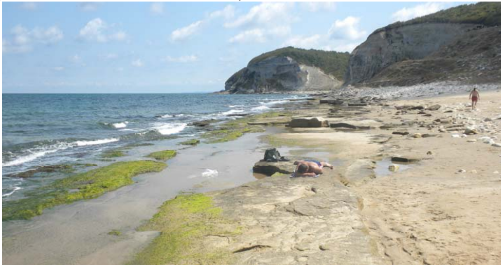
Fig 7. Beachrock used for sunbathing south of Kiyiköy Port.

is the most convenient and attractive beach in the vicinity of Kiyiköy. The beach is made up of light brownish and yellowish beach sand, and is limited to gullies that have developed on weathered granites. The beach is extremely clean and it was observed that local and foreign tourists set up tents on the beach. However, the northern part of the beach is mossy and the presence of seaweed ( Posidonia ) detracts from the quality of the beach.