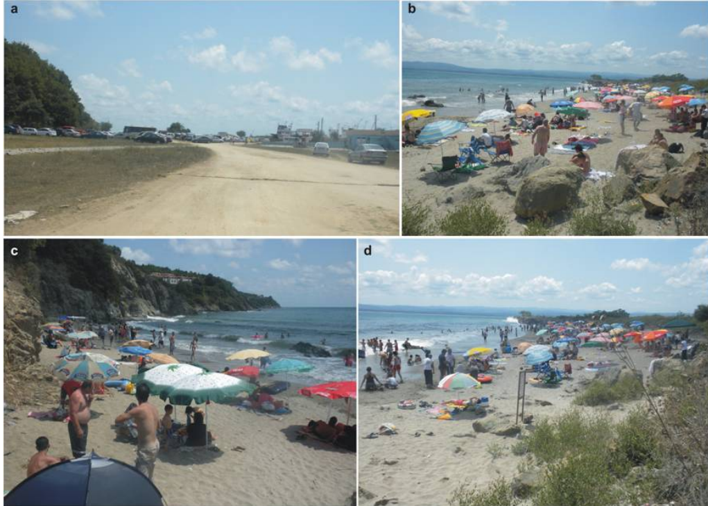
Fig. 2. Filled area used as a car park on east coast of İğneada Port.

2000 mm/yr). From the climatic viewpoint, a humid-temperate Black Sea climate prevails (Türkeş, 1996; İyigun et al., 2013) and the tidal range is less than 30 cm. Access to the area from Istanbul or Edirne near the Bulgarian border is possible via the European E80 motorway. Both towns, İğneada and Kıyıköy, lie at a distance of about 200 km from Istanbul.