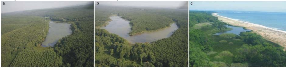
Fig 5. Lakes in lower basin of Bulanık Creek: (a) Lake Pedina, (b) Lake Hamam, and (c) Lake Saka.

sand and reaches a width of 90-120 m in general though it narrows to 30 m in places. It is estimated that this long sandy beach has an area of 131 hectares (Özkan and Kubaş, 2012).